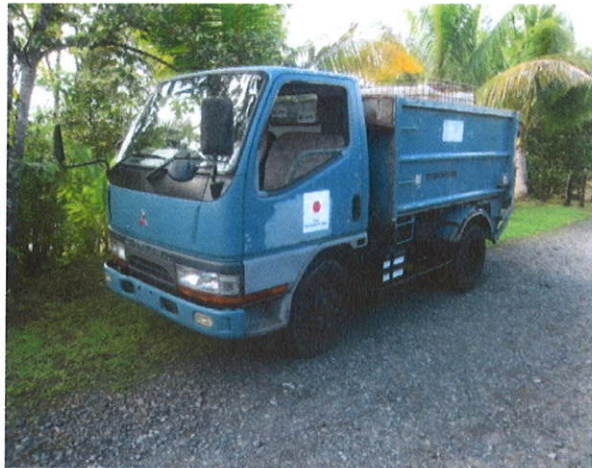
Collection Truck (flat-bed)