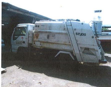
NGARDMAU STATE GOVERNMENT REPUBLIC OF PALAU

Period from March 25, 2011 thru March 24, 2012